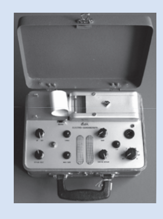
1960s era Both electrocardiograph (ECG) machine.