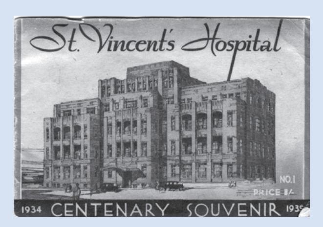
1935 brochureproduced in Melbourne's centenary year about St Vincent's newly opened hospital wing (Healy Wing).